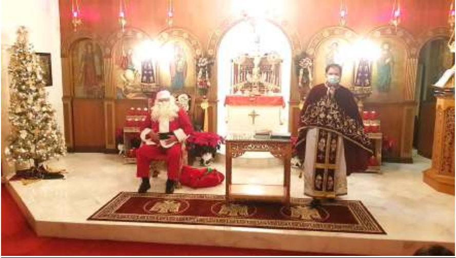
Santa came to our church